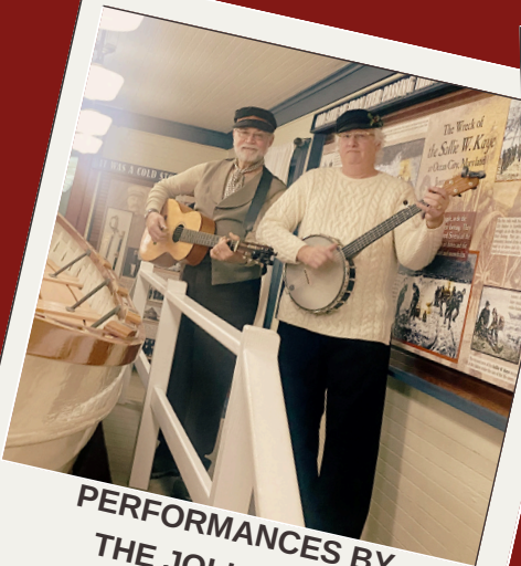
PERFORMANCES BY THE JOLLY TARS STARTING AT 11:30AM