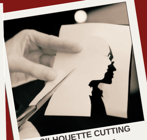
SILHOUETTE CUTTING 10AM-1PM, $10 REGISTRATION REQUIRED